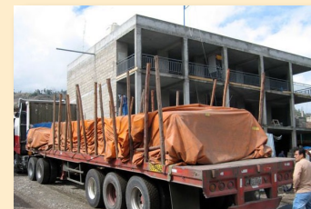
A Truck brings the donated tiles from Limas. ◀

The date for the inauguration of the Children's House has been set for 16 April. Work on the building is slowly reaching its final stages. We are rejoicing in the gift of all the tiles for the house from the Peruvian company Celima. Relius Coatings Inc. of Memmingen donated 3 huge containers of paint for the building as a Christmas gift worth € 18,000.